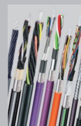
Cables in motion

TSUBAKIMOTO EUROPE B.V. AVENTURIJN 1200 3316 LB DORDRECHT THE NETHERLANDS TEL: +31 (0)78 620 4000 FAX: +31 (0)78 620 4001 E-MAIL: INFO@TSUBAKI.EU INTERNET: HTTP://TSUBAKI.EU