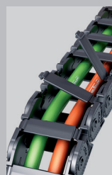
Plastic cable carrier systems