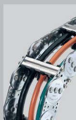
Steel cable carrier systems

For more information, please visit: kabelschlepp.de