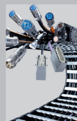
TOTALTRAX complete systems